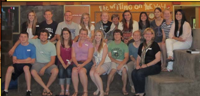
Youth Ministry staff, students, and others took a trip to Kenya this summer!